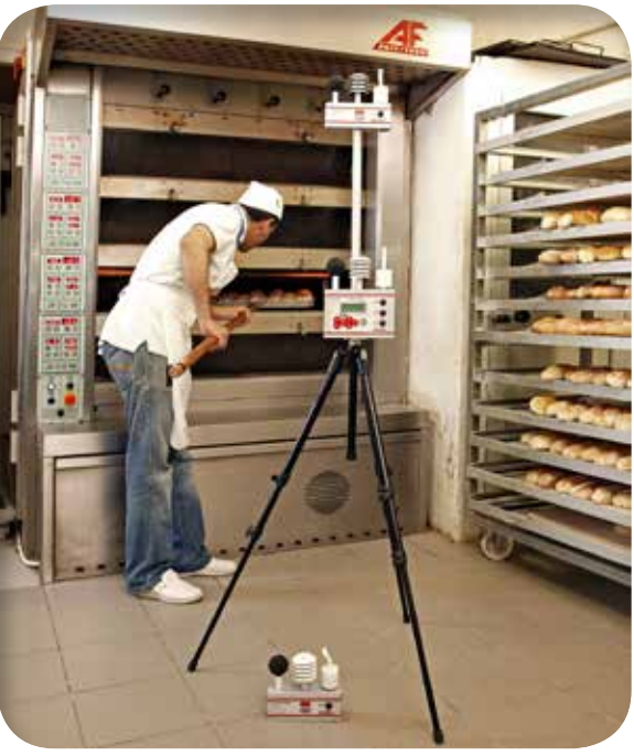
Three levels WBGT on the same vertical

Using HS Manager will be possible to perform analysis of the results of Heat Shield and to evaluate working limits. HS Manager always comes together with Heat Shield units. GIDAS TEA is an optional program. Read more about it in the LSI-LASTEM's Software catalogue (MW9006).