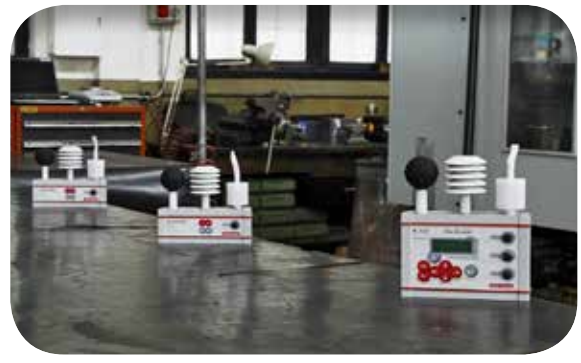
WBGT in three positions of the same environment